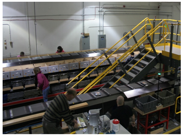
King County Library System Sorting Facility (2007).