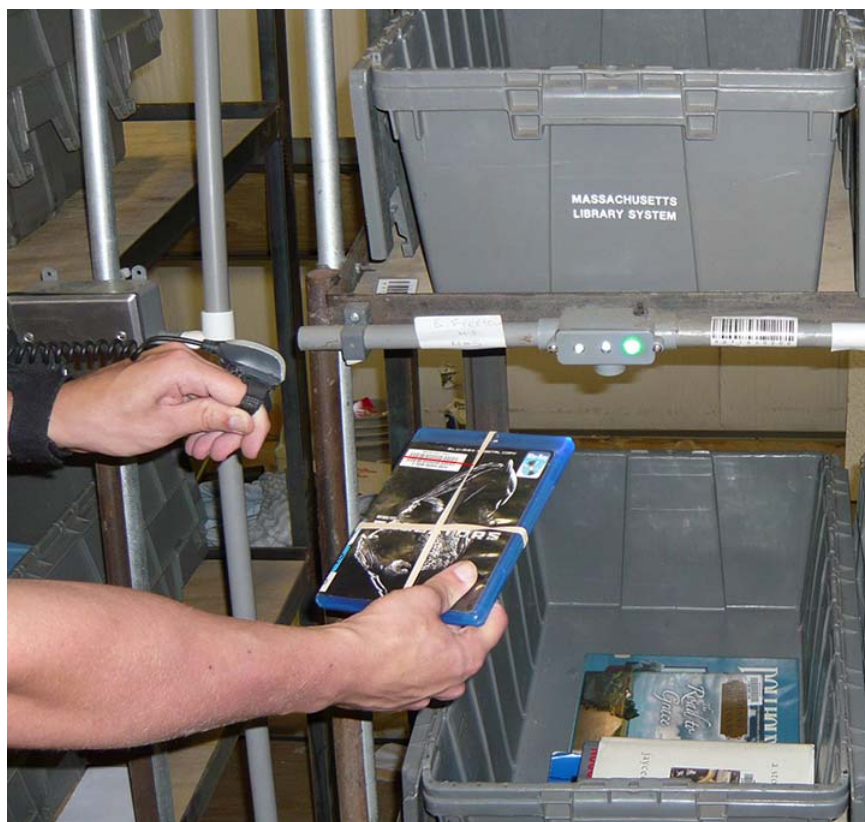
This picture shows Sort-to-Light wrist/finger barcode scanner and LED indicator on destination tote. (Note: Photo enhanced by the authors to emphasize red barcode scan beam and the green LED destination indicator light).