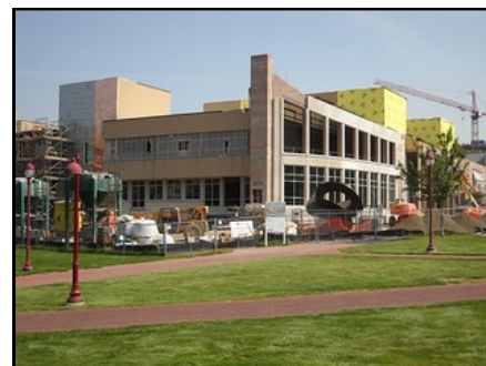
Southwest corner of Penrose Library