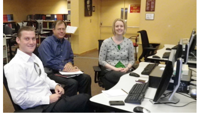
Research Center Consultation Room in Penrose@Driscoll

The Research Center has been offering students, faculty, and staff expert guidance through the research process since 2008. At the Research Center, quick questions received in person, or by phone, email, chat, or text, are answered at the desk while more complex questions are answered in one-hour consultations by subject-specialist reference librarians.