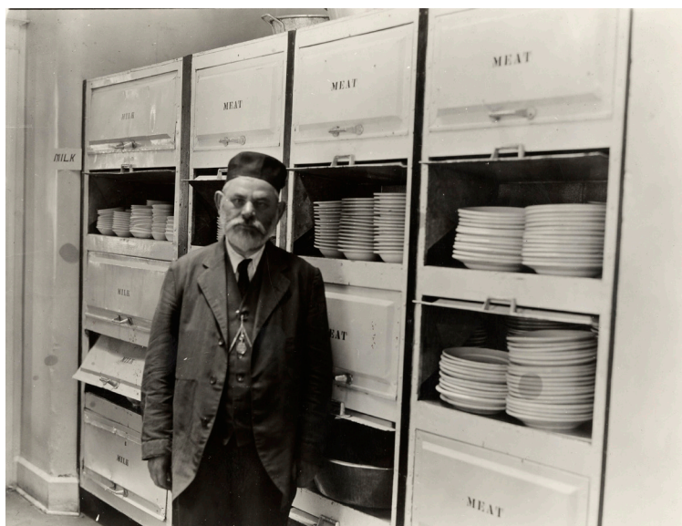
Figure 1. The mashgiach at the JCRS’s kosher kitchen, c. 1930s.

In the late nineteenth and early twentieth century, tuberculosis was the leading cause of death