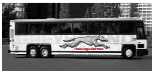
Courier book totes and a Greyhound bus (above).