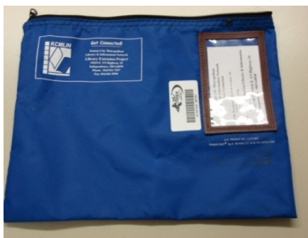
KCMLIN Bag

Both organizations have tested their method of packaging and delivery and feel their mode works best for the libraries they serve. Both organizations have invested a substantial amount of time and money into their packaging systems, but in the nature of collaboration have found a compromise that works. COKAMO libraries have adapted to accepting items from partner libraries regardless of how they are packaged.